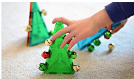
Magna-Tiles & Jingle Bells Christmas Invitation to Play